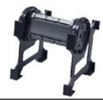
DemiMod™ in the Rover Stand™