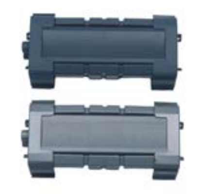
Regular & Special Forces DemiMod™