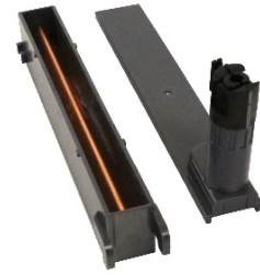
Dioplex EOD™ with lid removed

Contact sales@explosives.net , telephone +44(0)1249 65 1111 or speak to your authorised Alford representative.