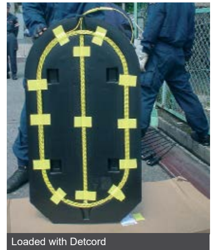
Loaded with Detcord