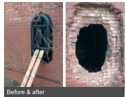
Before & after