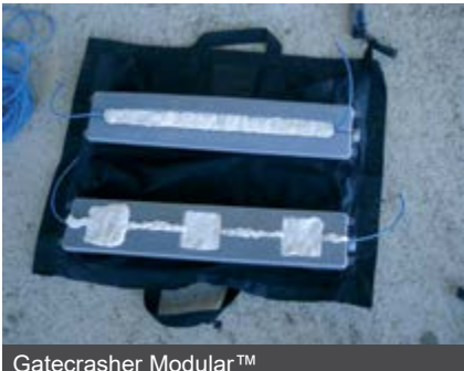
Gatecrasher Modular™ Type 1 (Bottom) & Type 2 (Top) Loaded

Other products to consider: Gatecrasher<sup>™</sup> – rigid wall breaching charge Alford Strip<sup>™</sup> 25mm and 42mm - window, door or wall breaching Breacher's Boot<sup>™</sup> – Light or Heavy door breaching HydroTape™ Breacher's Tape™