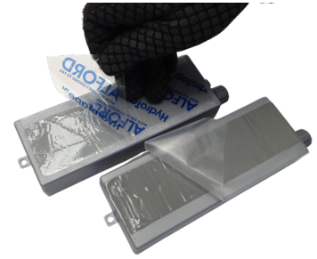
HydroTape™ (left), Breacher's Tape™ (right) applied to a charge

Contact sales@explosives.net , telephone +44(0)1249 65 1111 or speak to your authorised Alford representative.