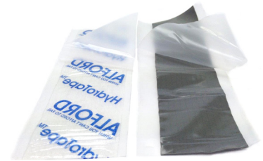
HydroTape™ (left), Breacher's Tape™ (right)