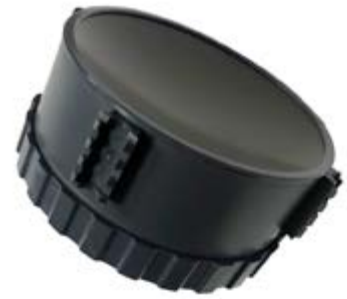
Vesuvius™ charge body

Contact sales@explosives.net , telephone +44(0)1249 65 1111 or speak to your authorised Alford representative.